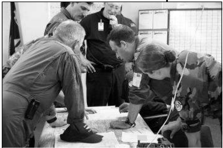
While Pilots, Air Crews, and Ground Teams worked out in the field to accomplish the assigned missions, there were over 30 CAP members working at the Mission Base to provide oversight.

After the successful completion of two weeks of training and unexpected twists and turns in the emergency scenarios, the members of Civil Air Patrol’s Washington Wing demonstrated their ability to respond to emergencies in their local communities as well as for the entire state and Pacific Region. The Air Force Evaluation Team gave Washington Wing a grade of outstanding, the highest score possible. Civil Air Patrol has been in existence since 1941, and its mission has always been to stand ready to help in times of emergency and disaster. The outstanding performances by the members of Washington Wing prove that they are ready to fulfill that mission today.