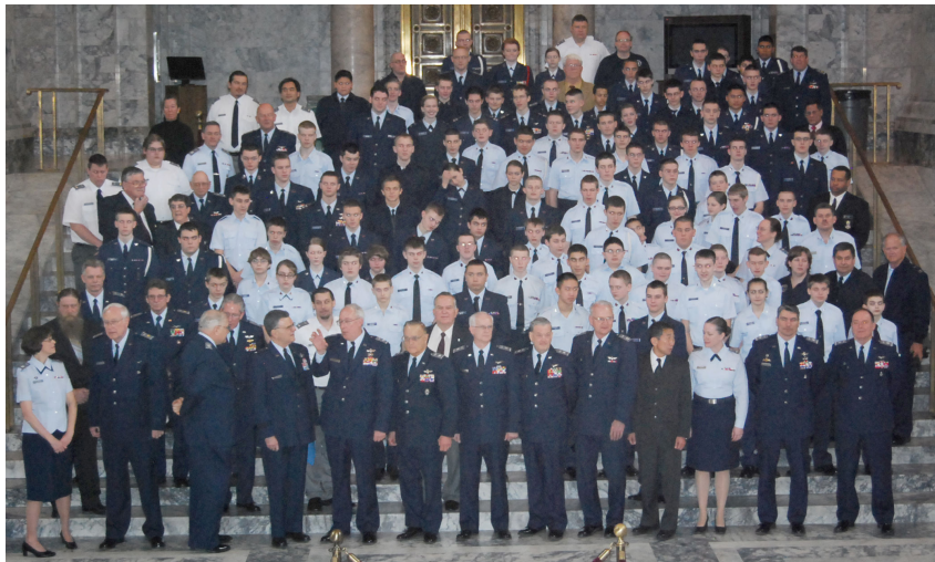
Left: Many cadets and seniors attended, making it difficult for a proper photo shoot!